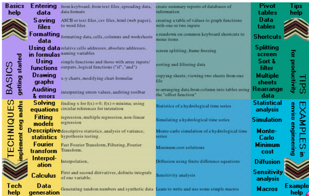
Figure 2 Main screen of web site 5 . http://www.ecr.mu.oz.au/~xlr8tr/

appropriate to their level directly from the initial screen was an important consideration. Figure 2 shows a screenshot of the main interface illustrating at the top level the four focus areas ranging from “Basics” through “Tips” to “Techniques” and “Examples”. In each quadrant, seven subtopics were developed and for each subtopic, a short description of the content of the subtopic is outlined. Experience has shown that one of the key aspects that prevent students from making rapid progress in developing software skills is the language barrier of knowing where to search in the printed or on-line manual. Therefore, an attempt has been made to explain each access point to the learning material in two different manners. Brief advice on how the “Basics” and “Tips” quadrants are best approached is readily accessible from the main screen. In the learning files associated with each quadrant a similar format has been used to help student recognition and navigation. Extensive use has been made of fragments of screen shots to illustrate the key points so that a student who is working through the examples with Excel software can easily relate them to the web site. In the more complex “Techniques” and “Examples” quadrants, many example Excel files are provided to allow students to download fully worked examples that can be explored, modified and combined to develop deep understanding of the software and the problems being tackled.