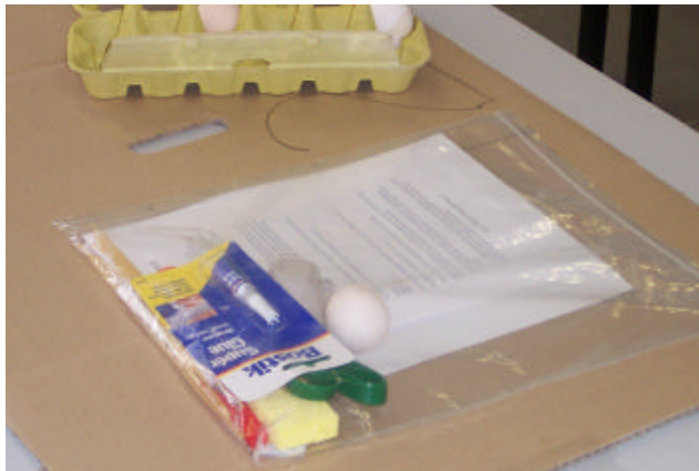
Figure 1 Materials given to each group for the impromptu design task

The task simulated the designing, building and testing of a bus shelter to protect the life of an occupant (the egg) that could withstand the impact of a model truck along a ramp (2m long at an angle of 45 degrees with a hard stop at the end). A diagram of the testing ramp was provided, and students had access to the model truck that was used in the testing phase.