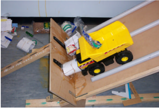
Figure 2 Students' design on the testing apparatus

the impromptu design activity (the assessable component of the task) which required them to reflect on their task performance, including both their experience of the design process and their performance as a team.